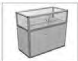
F5 玻璃矮饰柜 (不含灯具) L990×W495×H1000