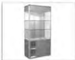
F2 玻璃高柜 (不含灯具) L1000×W300×H2000