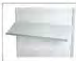
F10 斜搁板 L990×W310