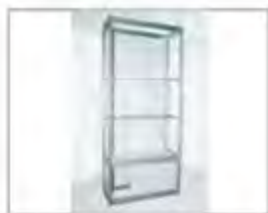
F1 展柜 (玻璃层板) L1000×W300×H2000