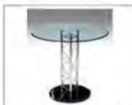
F14 玻璃圆台 R400×H800