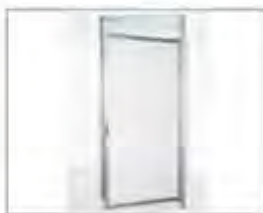
F11 铝合金门 L1000×H2400