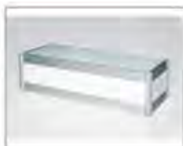
F6 展台 L990×W495×H300