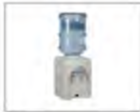
F19 饮水机 展会期间含配一桶水