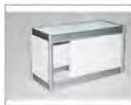
F4 地柜 (配锁) L990×W495×H750