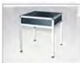
F13 铝合金方台 L650×W650×H680