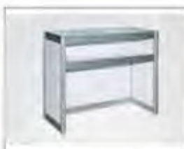
F3 报到处 L990×W495×H1000