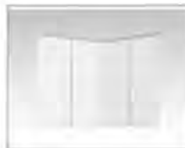
F12 展板 L990×H2480