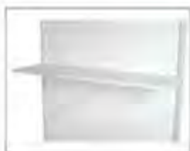
F9 平搁板 L990×W310