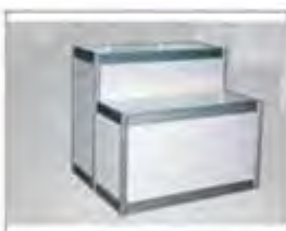
F7 高低展柜 (A) L990×W495/495×H1000/750