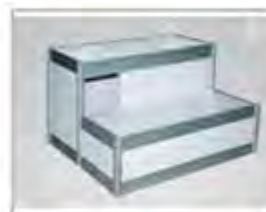
F8 高低展柜 (B) L990×W495/495×H750/300