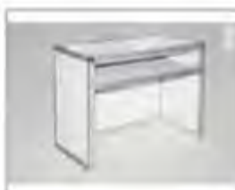
F15 铝合金咨询台 L950×W450×H760